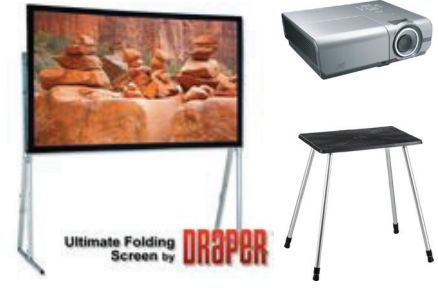
Table size : 17" x 25"