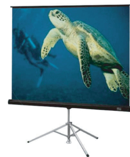
Table size : 17" x 25"