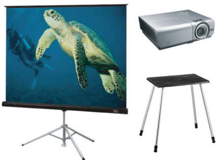
Table size : 17" x 25"