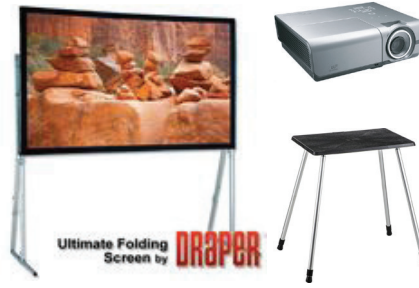
Table size : 17" x 25"