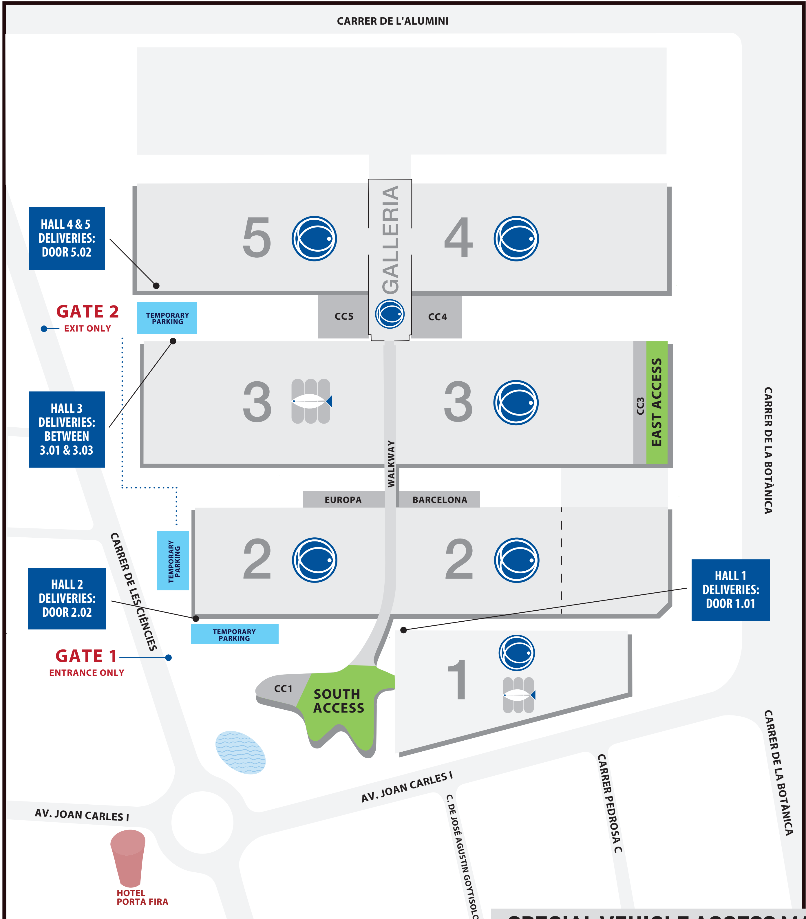
SPECIAL VEHICLE ACCESS MAP