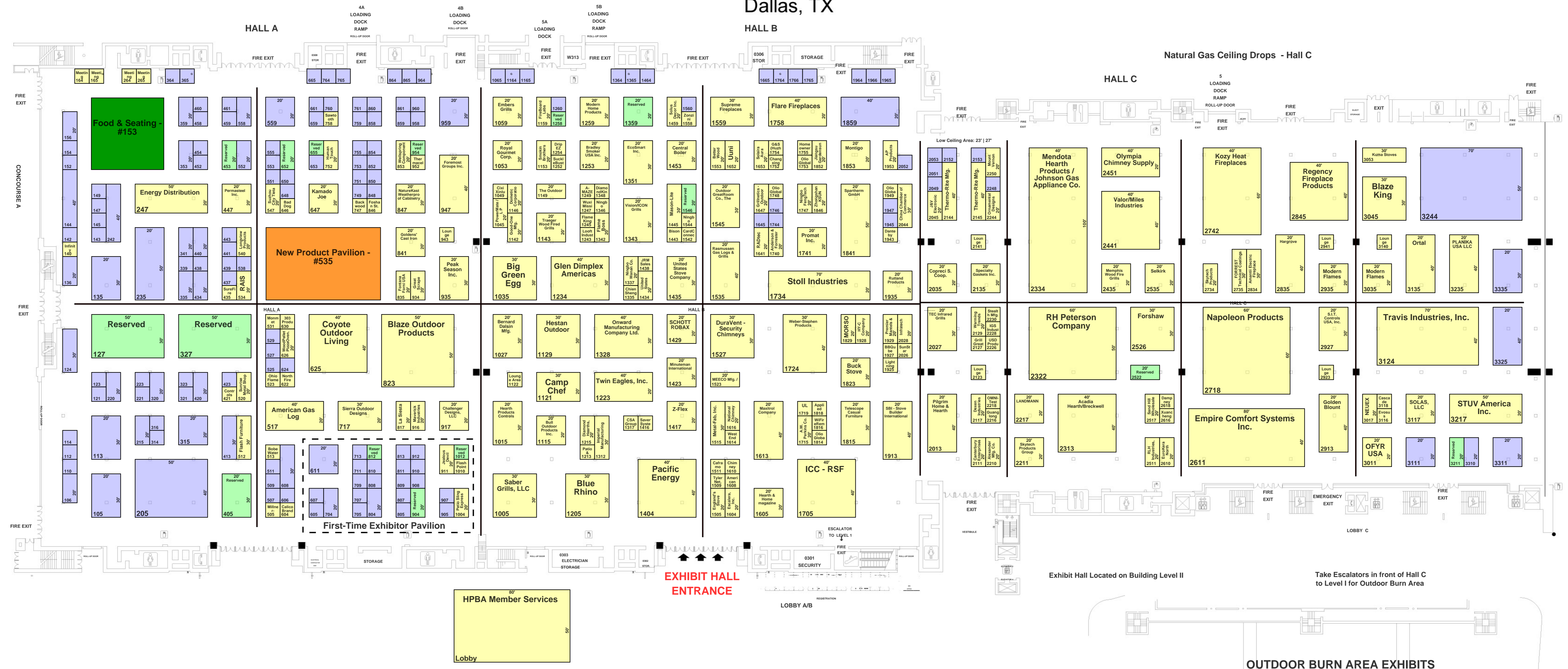
EXHIBIT HALL ENTRANCE

Exhibit Hall Located on Building Level II